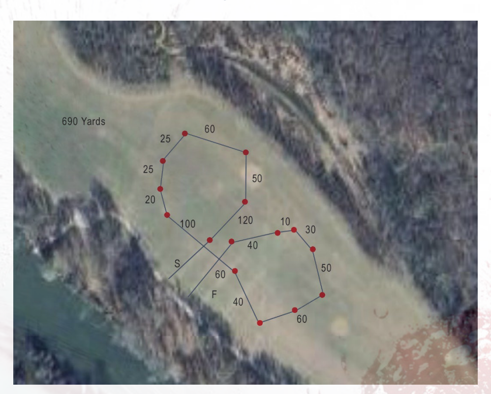
Sunday Course Plan